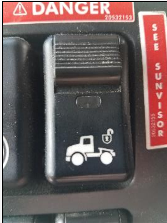
IN-CAB DASH RELEASE BUTTON