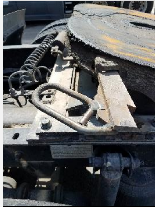
FIFTH WHEEL RELEASE